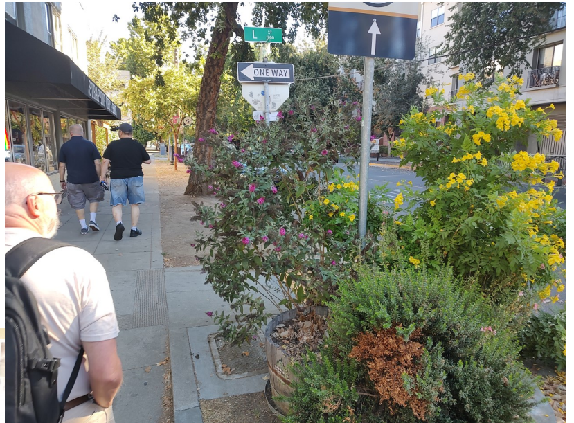
A beautiful morning walk back from breakfast to the Big Show