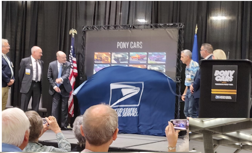
First Day of Issue Ceremony PONY CARS Great American Stamp Show August 25, 2022 Cars on display from California Automobile Museum