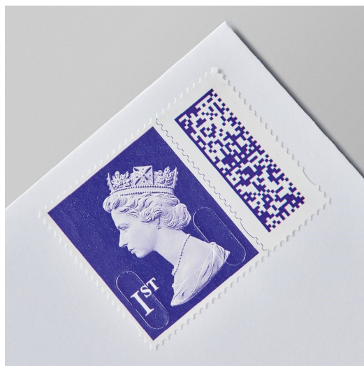
A current Machin stamp available on the Royal Mail's website with the new bar code.

So much as happened since the last newsletter that I feel needs to be shared. If you are a Great Britain collector and in particular a Machins specialist, your collection is now at an end. With the passing of the Queen, everything will change. What those changes will be and how soon are a matter of speculation. It will be interesting to see what the Brits come up with to replace those iconic stamps. You can read on the Royal Mail's website how the artist and the design for these long running definitives came into being.