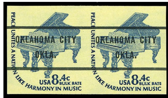
Above: #2175 Red Cloud Full Sheet Untagged Error Below: #1616a Dome of the Capitol Imperforate Error and Miscut Freak On Right: #1615Cf Steinway Grand 1857 Imperforate Error

At the Schuyler Rumsey auction I did acquire a great couple of items for my Bicentennial collection. A strip of six, imperforate with a line pair and a freak to boot. Miscut with two plate numbers clearly visible. Plus, a rare imperforate pair with the Oklahoma City, Okla. precancel.